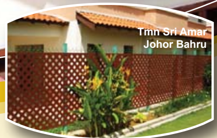
Tmn Sri Amar Johor Bahru