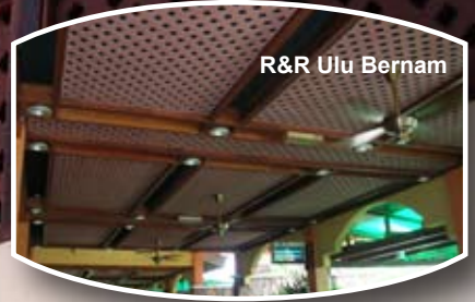
R&R Ulu Bernam